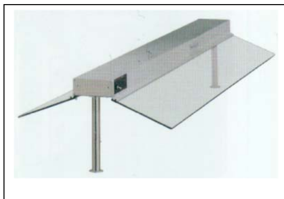
GRAH - 48