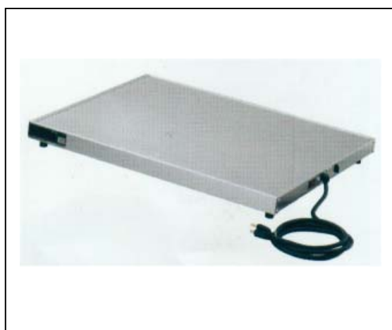
GRS - 36